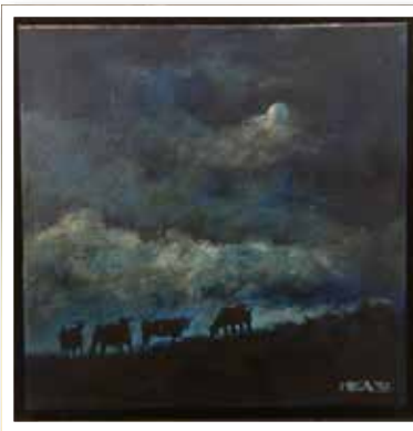
4 in a Blue Moon