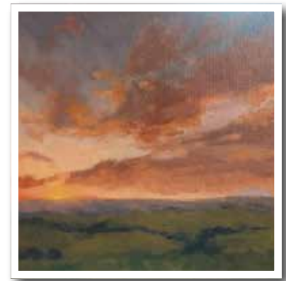
Flint Hills Sunset