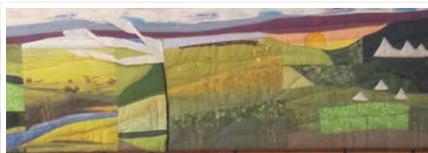
The Flint Hills are Alive