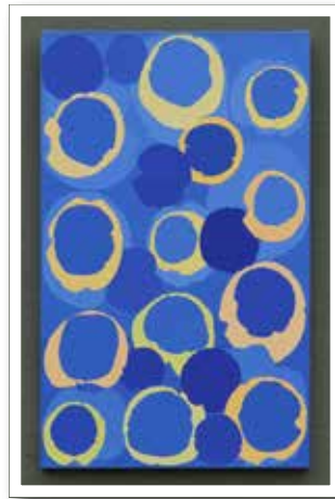
Starry Play-Dough Night