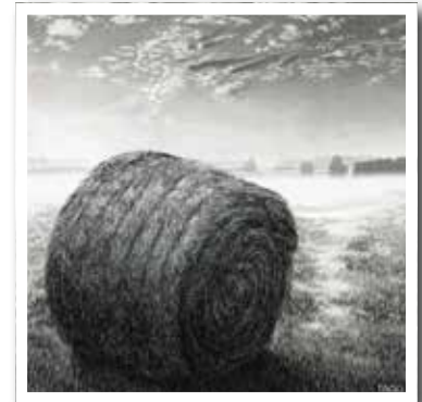
Alone & Forgotten