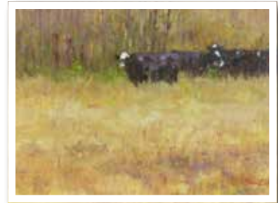
Mixed Herd in Trees