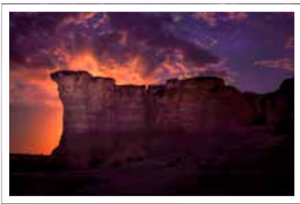
Fire in the Rocks