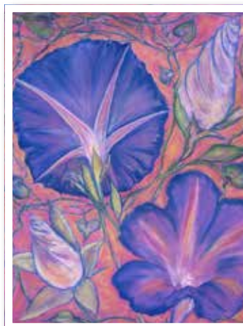
Morning Glories Hallelujah