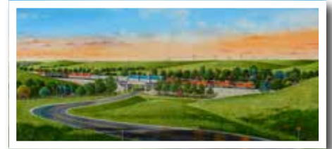
Rails & Trails