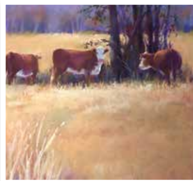
Three at Standstill