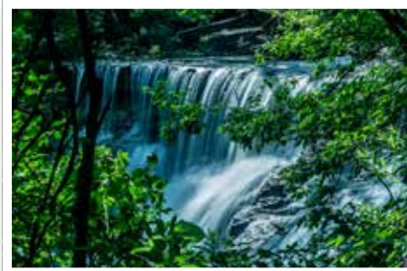
Cottonwood Falls in the Summer