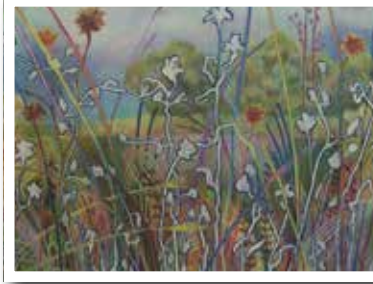
West Park Fantasia