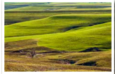
The Flint Hills