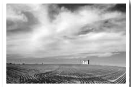
Winter Wheat, Phillips County