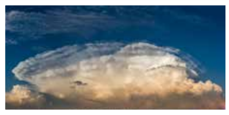
Kansas Summer Storm at Sunset